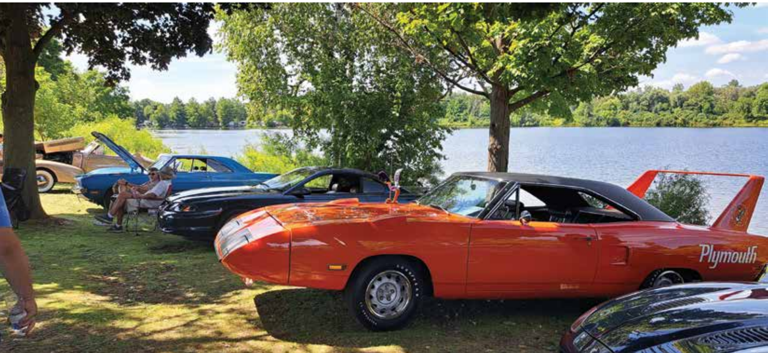
▲ Acton Legion's classic car show with 250 vehicles displayed, was held on Aug. 28 next to beautiful Fairy Lake in Acton.